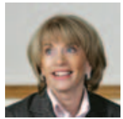
Ann Gloag OBE